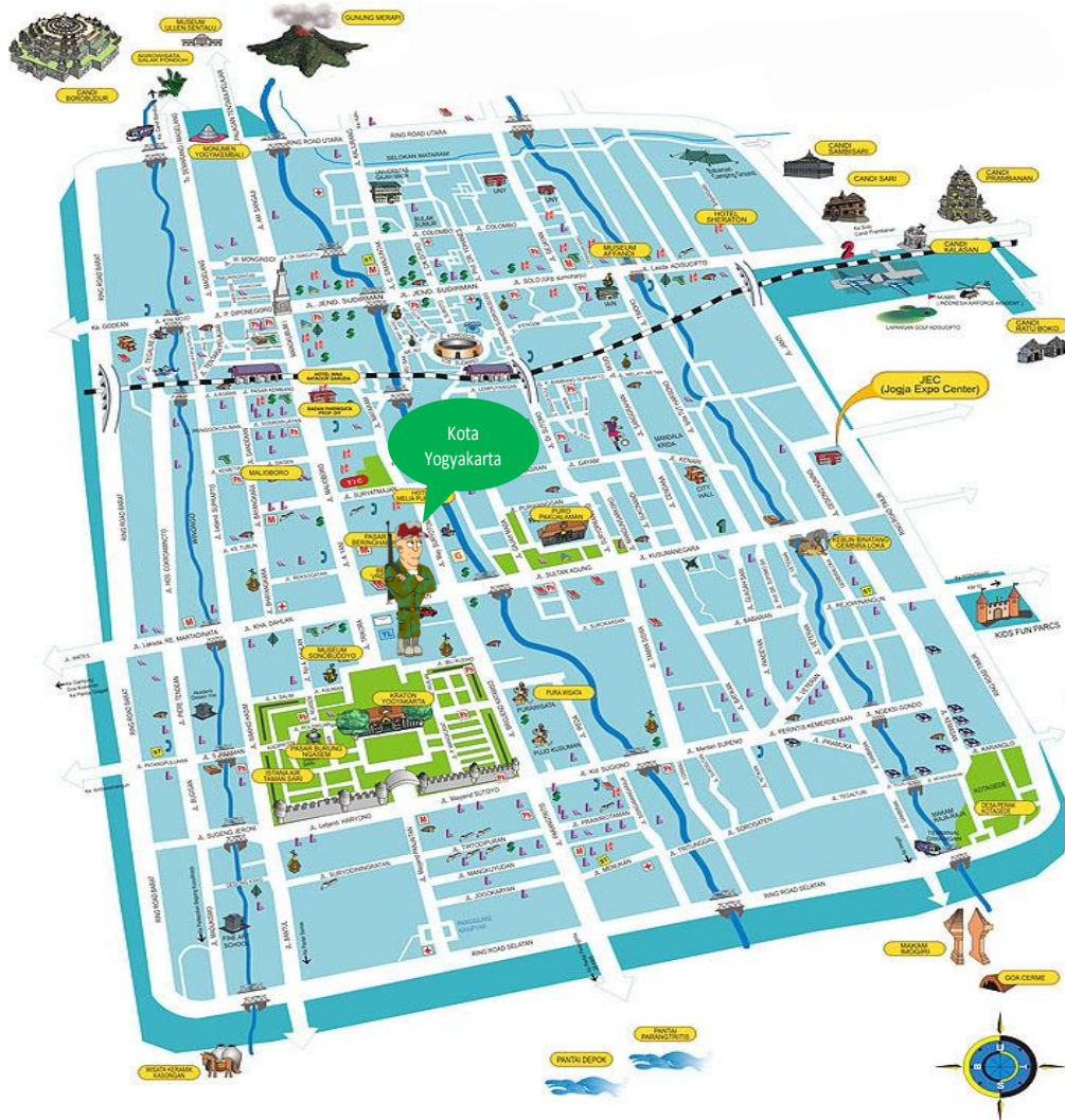
Picture 2. Evaluation in Digital Map Media