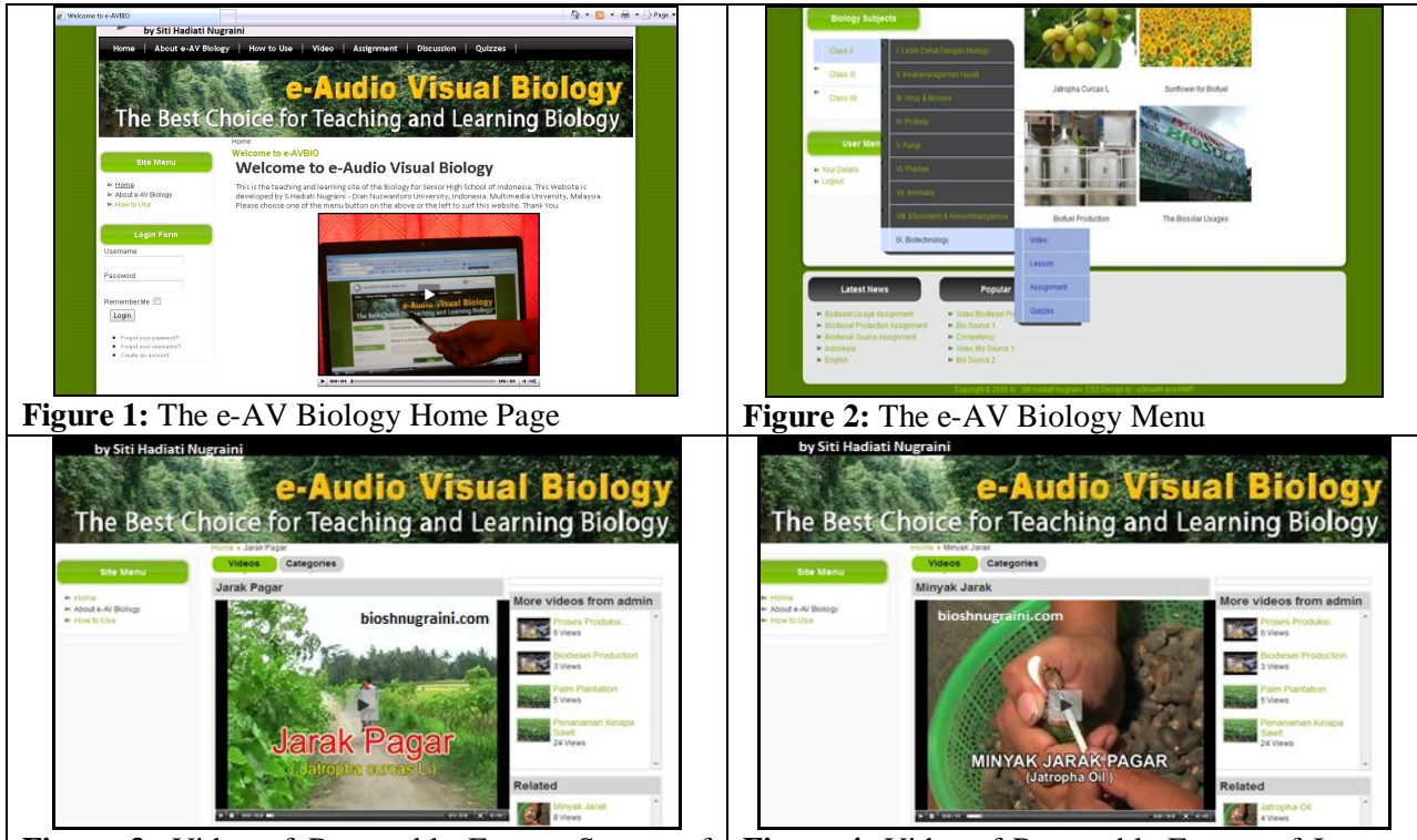
Figure 3: Video of Renewable Energy Source of Figure 4: Video of Renewable Energy of Jatropa

This part facilitates the students to share the knowledge in the relevant content.