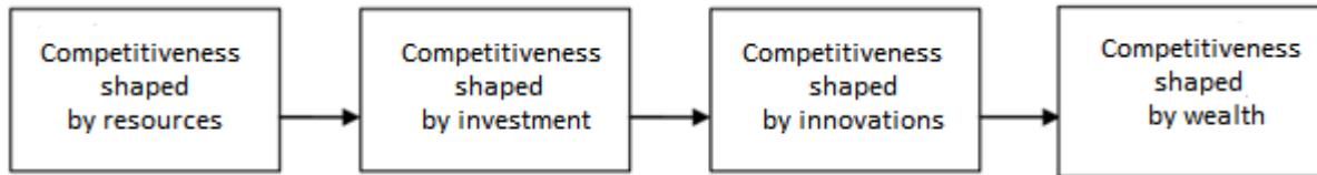
Fig.1: Stages of Competitive Development According to M. Porter

Considering the contemporary conditions of the development of businesses, sectors, industries and the whole national economies, we can point out that the characteristic feature of this development is the growing competition, the progressing globalization, and the increasing requirements and expectations of customers/the society. Thus, efficient and effective conducting business activity is connected with a necessity to possess a vision for which the strategy of development and the adequate development management system become the realization.