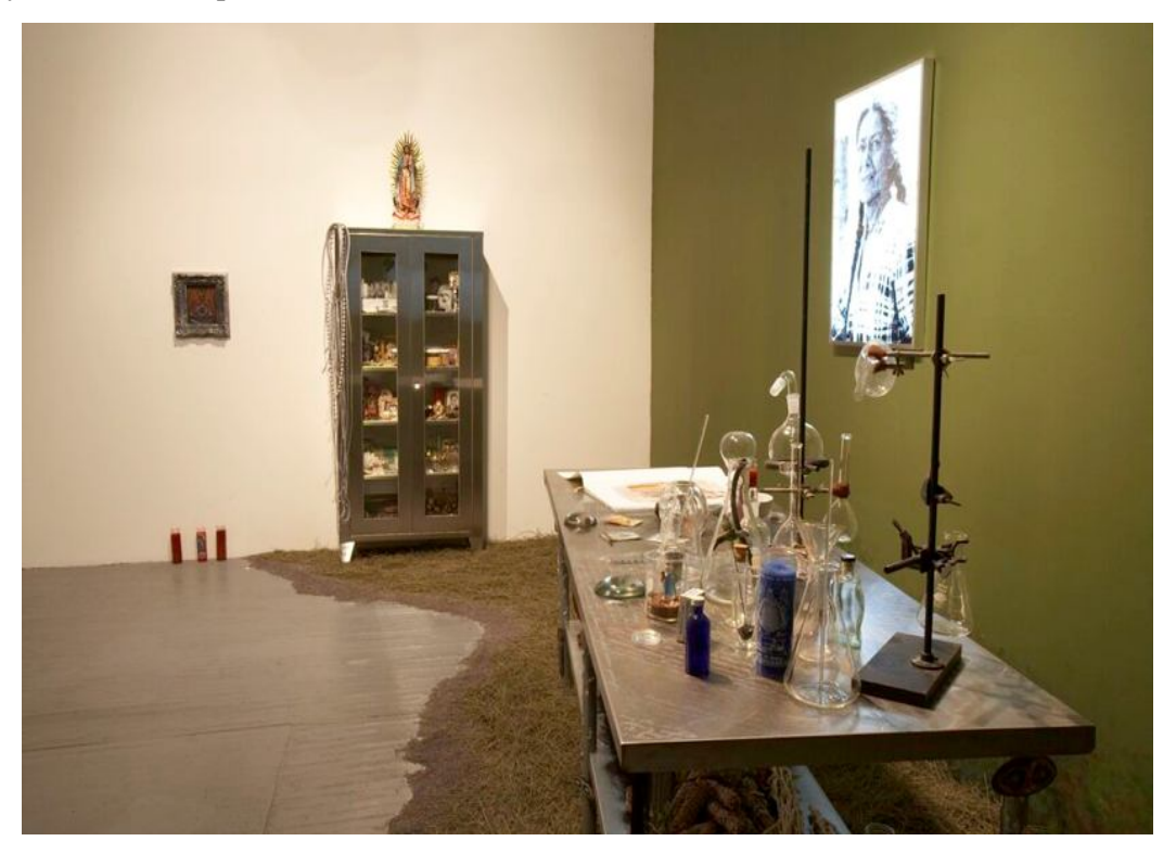
Figure 3. Amalia Mesa Bains, The Curanders's Botanica, 2008; Collection of Richard L. Bains; Photo: Matthew Septimus; courtesy P.S.1 Contemporary art Center

The paper's intention is to open up a discussion on the more understudied aspects of African-derived folk cosmology, on its favoring of a seditious coalescence of the real and the imaginary and its intersections with technology and with cultural universals. Such a discussion might explore the multifarious implications of the diachronic and productive dialectic between the empirically visible and the felt invisible as inscribed in Juju's contemporary multi-media representations.