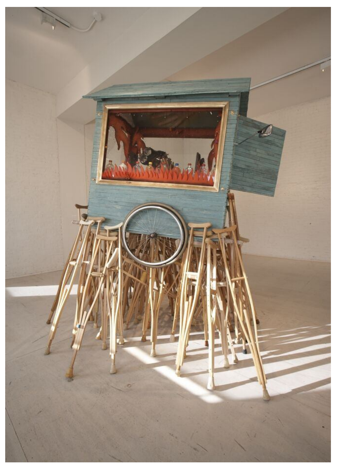
Figure 4: . Pepon Osorio, Lonely Soul, 2008; courtesy Ronald Feldman, Fine Arts, New York; Photo: Matthew Septimus; courtesy P.S.1 Contemporary Art Center