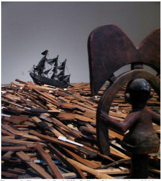
Figure 2. Figure 4. Radcliffe Bailey, Storm at Sea , 2006; courtesy of the artist and Jack Shainman Gallery, New York

The (disabled) body, stage brutality, performance documentation (video), digital scenography, hypertextual-interactive spaces, and (the detritus of) memory represented in experimental mise-en-scène (Figure 5), all combine to penetrate subject-ed discourses, manipulating technology's incursions and materializing the subjectivities, kinetic and body codes, synesthetic modes, corporeal limits and (im)possibilities that the hoodoo "magical" tradition spiritually embraced, performatively expressed and culturally established.